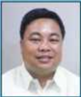
Hon. ARNEL C. MATIA