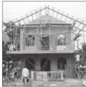
Construction of Tourism Information Center/Library/Archive