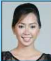
Hon. ROSE KAREEN S. DEFENSOR