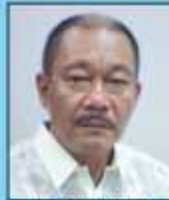
Hon. ARIEL V. NOVO