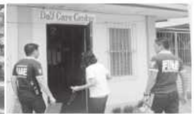
Mina Fire Station personnel conduct Fire Safety Inspection in some schools in preparation to the opening of classes. CY 2016

For related emergency concerns please call 033-5309023