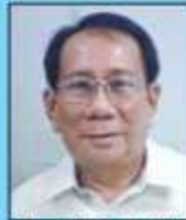
Hon. CELSO S. JUSTADO