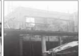
Construction of Evacuation Center (2nd Level of motorpool)