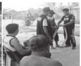
Conducted refresher course of Brgy. Tanod of Brgy. Cabalabagan