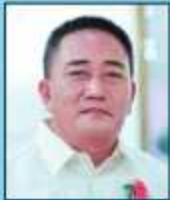
Hon. JUANITO D. GRABATO, JR.