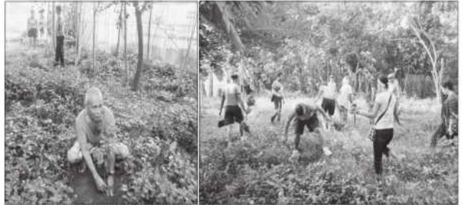
Mina PNP Personnel and town hall employees join the Tree Planting activity at the Montogawe Eco-Park