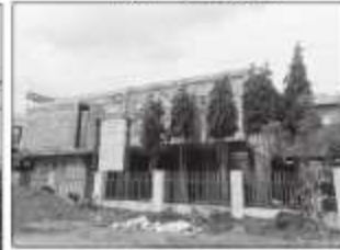
Construction of Evacuation Center Phase II