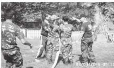
Conducted Fire Safety Lectures and Fire Drills at Mina National High School, Our Lady of the Pillar Catholic School and Dala - Singay Elementary School.