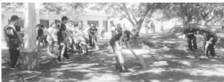
Mina Fire Station Personnel joined the program of Mina National High School in Brigada Eskwela