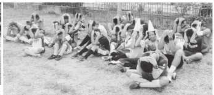
Mina BFP Personnel joined the simultaneous earthquake drill spearheaded by Local Government Unit.