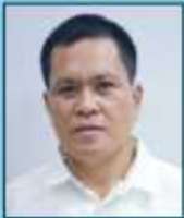
Hon. NOEL P. ESPIRITU