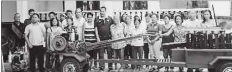
White Five (5) - Sets of Pump and Engine were received by Barangay Tipolo, Guibuangan, Janipaan, East, Talibong Grande and Capul-an Farmers Association

Hopefully, this endeavor and program will lead to a successful farming endeavor of our food makers.