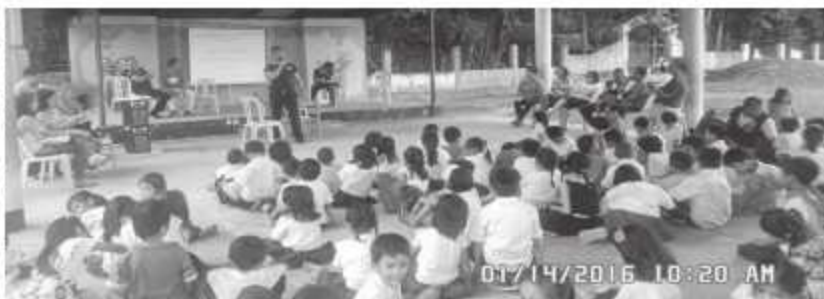
Conducted Fire exit drill and Earthquake Drill at Agmanaphao Elementary School last January 14, 2016.