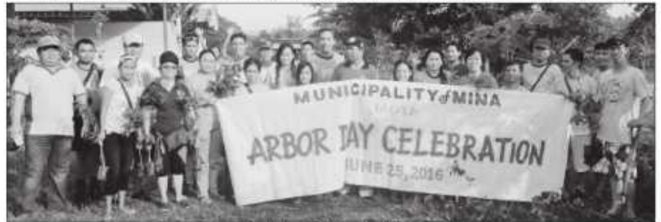
Group picture of participants joining the Arbor Day celebration.