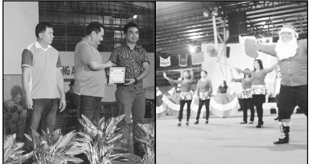
The highlight of Paskwa Halad sa Banwa-Christmas presentation and awarding ceremony

Another triumphant evening was witnessed by the Minanhons when the Municipality of Mina staged the culminating presentation of the Paskwa Halad sa Banwa 2014. It was jumpstarted with a raffle draw for the indigent members of our community.