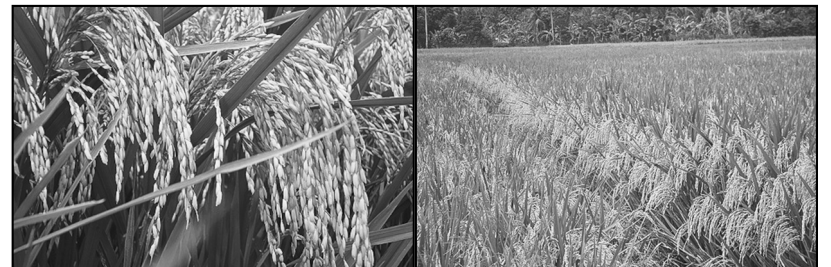
Hybrid Rice planted in demo farms

The Hybridization Program is one of the programs of the Department of Agriculture