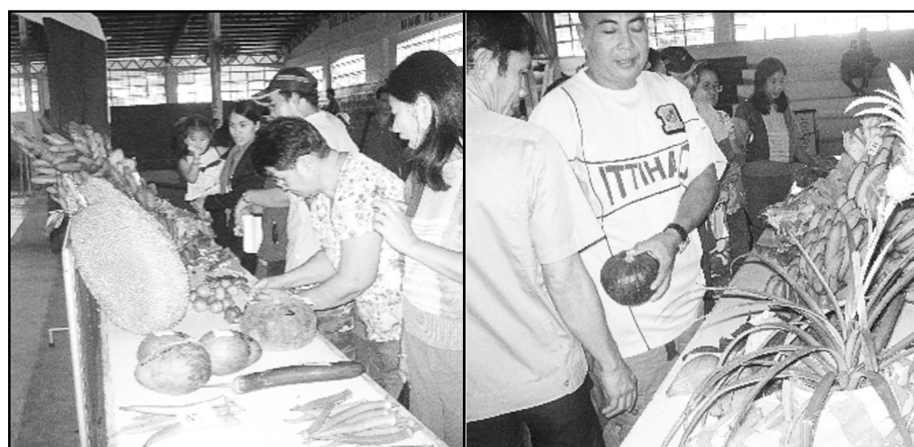
The PINAKA Contest, Tiangge Fair and the Well-Baby Contest during the Culminating Activity of the Nutrition Month

In line with this year's Nutrition Month Celebration center with the theme "Gutom At Malnutrition, Sama-Sama Nating Wakasan", the Local Government Unit of Mina, Iloilo held its Culminating Activity on July 28, 2014. It was participated