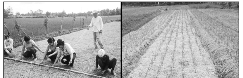
Shown are the Garlic Plantation located at Brgys. Tolarucan, Amiroy and Tumay.