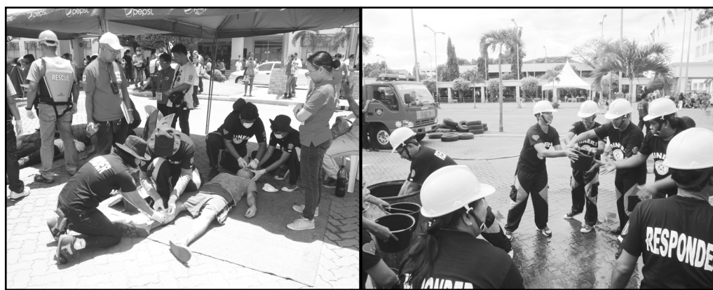
During the response Olympic, the Mina Responders Team as shown above is competing as the best in the different events.