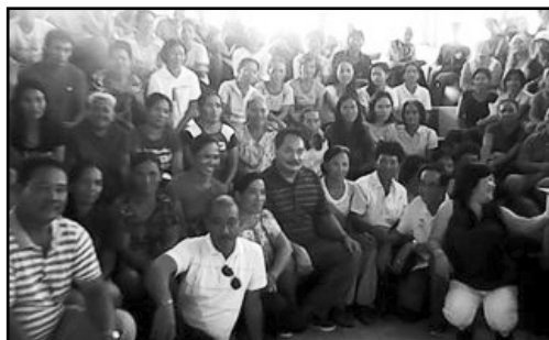
Victims of Typhoon Yolanda during the Distribution of Relief Goods

Among the priority concerns of this office are the victims of Typhoon Yolanda. Through DSWD Field Office VI, the LGU was able to receive relief goods for the 446 household victims of Typhoon Yolanda. The food packs