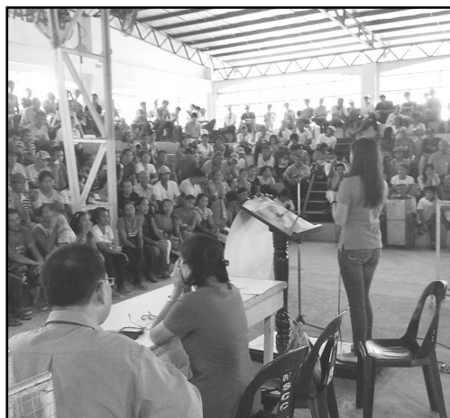
Participants of the Cash For Work Orientation

The personnel of DSWD FO VI and the MSWD Office conduct a one-day Orientation