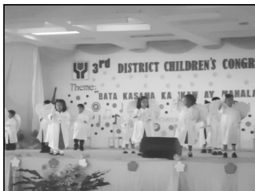
Different activities during the children's month celebration

The different Day Care Centers celebrated the Children's Month last October 2014. One of the activities was the holding of the Children's Congress-Municipal Level at Mina Sports and Cultural Center.