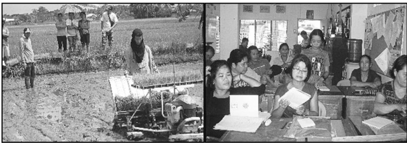
Shown are the pictures their actual training of ECSFFS and during the Graduation Ceremony

Enhanced Climate Smart Farmers Field School (ECSFFS) training was successfully held in Brgy. Mina East, Mina, Iloilo on May – November, 2014 with 46 graduates. A five-year World Bank funded program that promotes