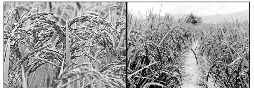
Organic Black Rice

The Organic Black Rice Production is another program which the Municipal Agriculturists are promoting to the farmers by planting black rice. Specifically, the organic black rice production is encouraged by using natural farming system, humus,