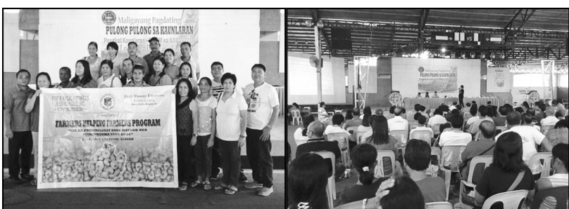
During the Pulong-pulong at Mina Sports and Cultural Center

The Vegetable Importer - Exporter Vendors Association (VIEVA) in collaboration with the DA-Regional Office, Provincial Agriculture Office, and other private partners conducted Pulong-Pulong