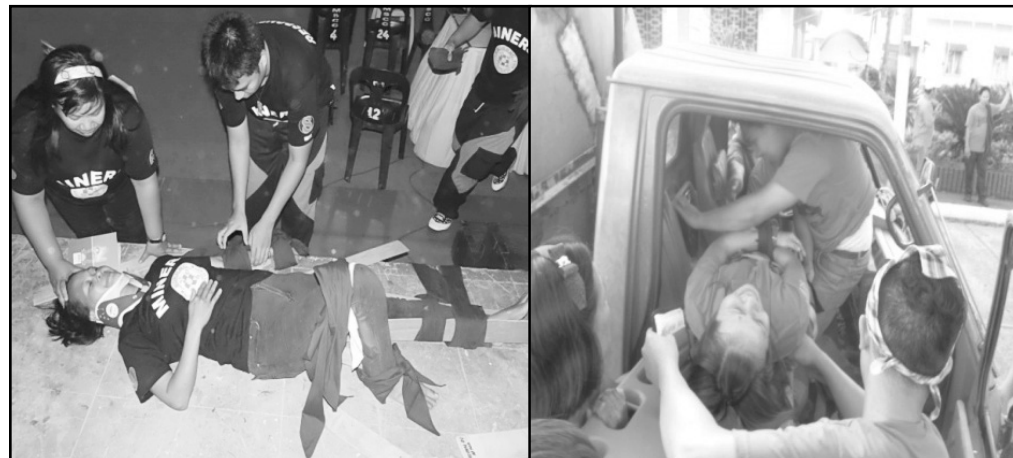
The Mina Elite Responders Team on training.

The geographic location and Physical environment of the Philippine Islands make it prone to all kinds of disasters. It is strategically located in the path of turbulent and destructive cyclones. The country's coastline of 17,461 kilometers makes it particularly vulnerable to tsunamis and storm surges that endanger coastal communities. It experiences an average of 20 typhoons per year, half of which are destructive seriously devastating.