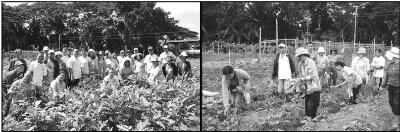
Actual training at the Eco-park

The objective of this activity is to promote technology for organic farming and to advocate safe and healthy food production. The training was conducted August 5, 2014 to December 12, 2014.