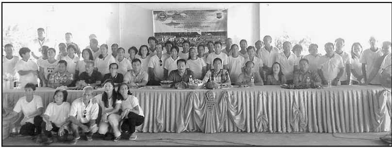
The participants and guests during the Graduation of the Season – long Training on Organic Vegetable Production

A Demo-farm for the Season-long Training on Organic Vegetable Production was established at the Municipal Eco-park in Bangac, Mina, Iloilo. A joint activity of the LGU through its Municipal Agriculture Office in partnership with the Provincial Agriculture